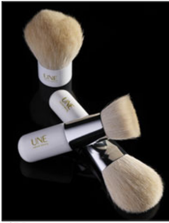
HCT France teamed with brand Une to develop portable brushes constructed using wood and aluminum.

Many brands are waking up to the benefits of a tool with a handle, which offers increased space for branding. "Applicators are becoming a work of art," says Clerke. Brush handles are routinely silk screened with multi-colored decorations and brand expressions.